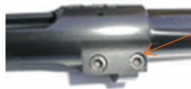
Barrel clamping bolts

Lift the receiver/barrel out of the stock. Loosen the barrel clamping bolts and pull the barrel